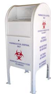
Pharmaceutical Drop-off container